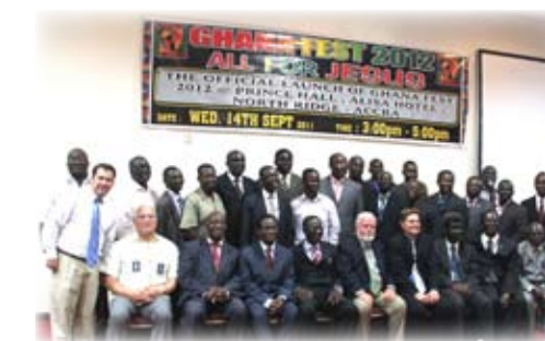
The launch for GhanaFest 2012 was a historic event!

The RSA mission team for GhanaFest is comprised of people from all over the USA and will be serving at medical clinics, women's conferences, the festival, and more! It will be exciting to see how the Lord answers prayers and fulfills His purpose for the nation of Ghana. The mission trip is scheduled for January 20-31, 2012. GhanaFest is the weekend of January 27-29. ●