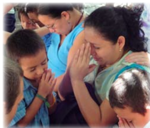
A woman and her son pray to receive Christ at an outreach event in El Salvador (summer 2010).