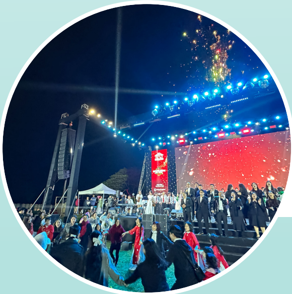
Hanoi Christmas Festival Saturday, Dec 2