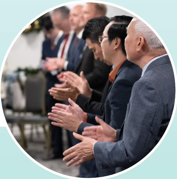
Men's Outreach Dinner Friday, Dec 1