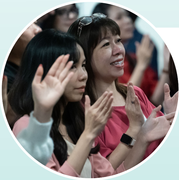
Women's Outreach Dinner Thursday, Nov 30