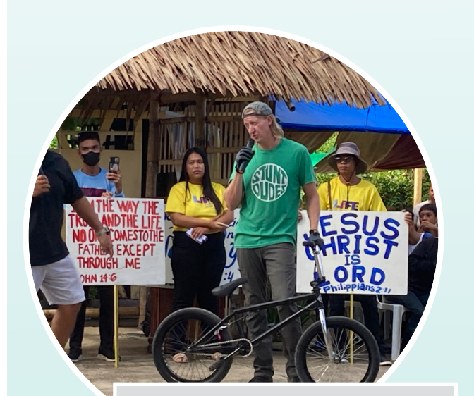
School Presentations Oct 9 - 13

The children made this outreach one to remember! There were hundreds of young ones who welcomed Jesus into their hearts. We believe these children will grow to influence their families and community for Jesus!